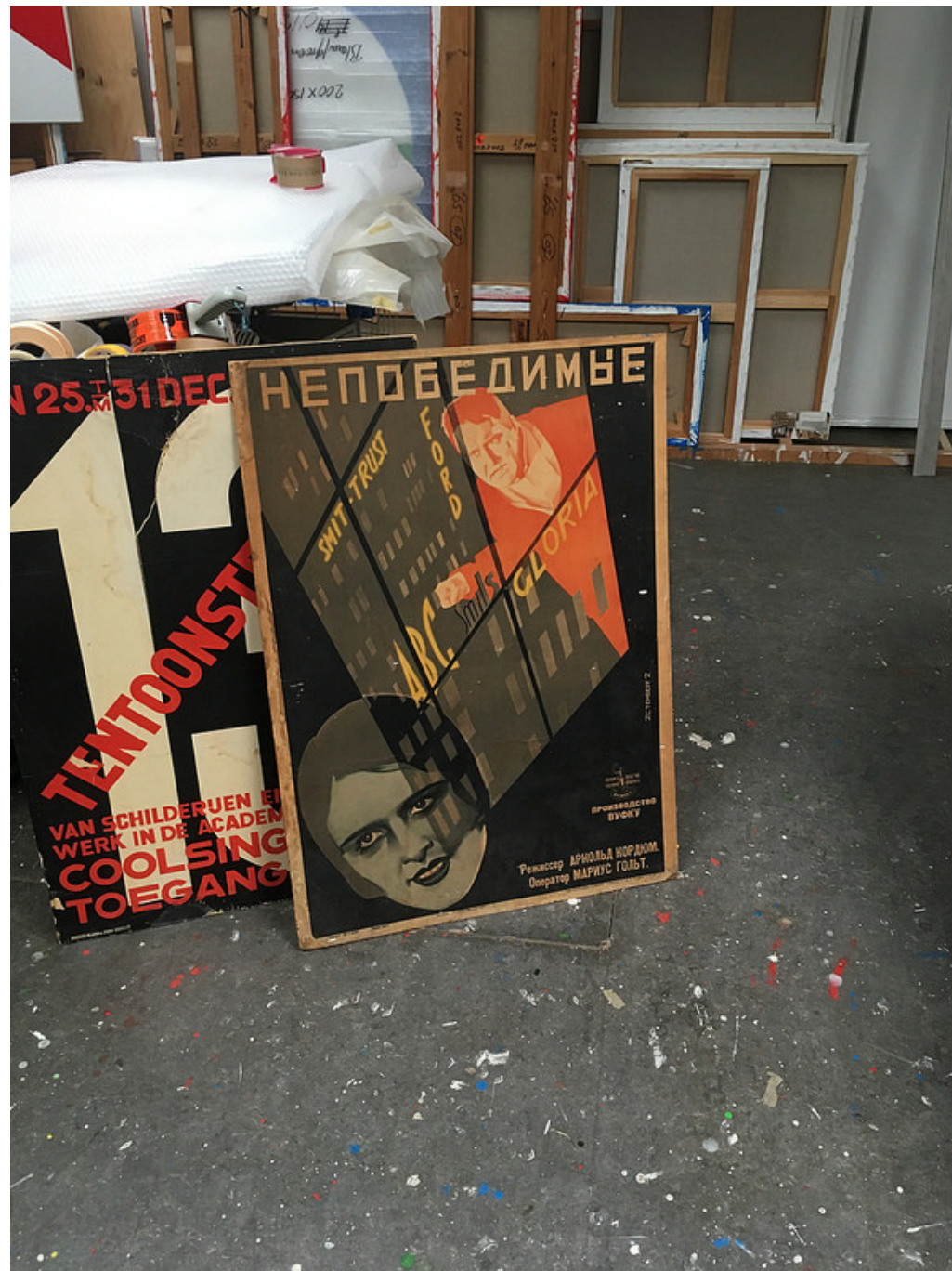
Paul Schuitema (1897–1973) famous Dutch graphic designer and photographer collected 3 Stenberg posters