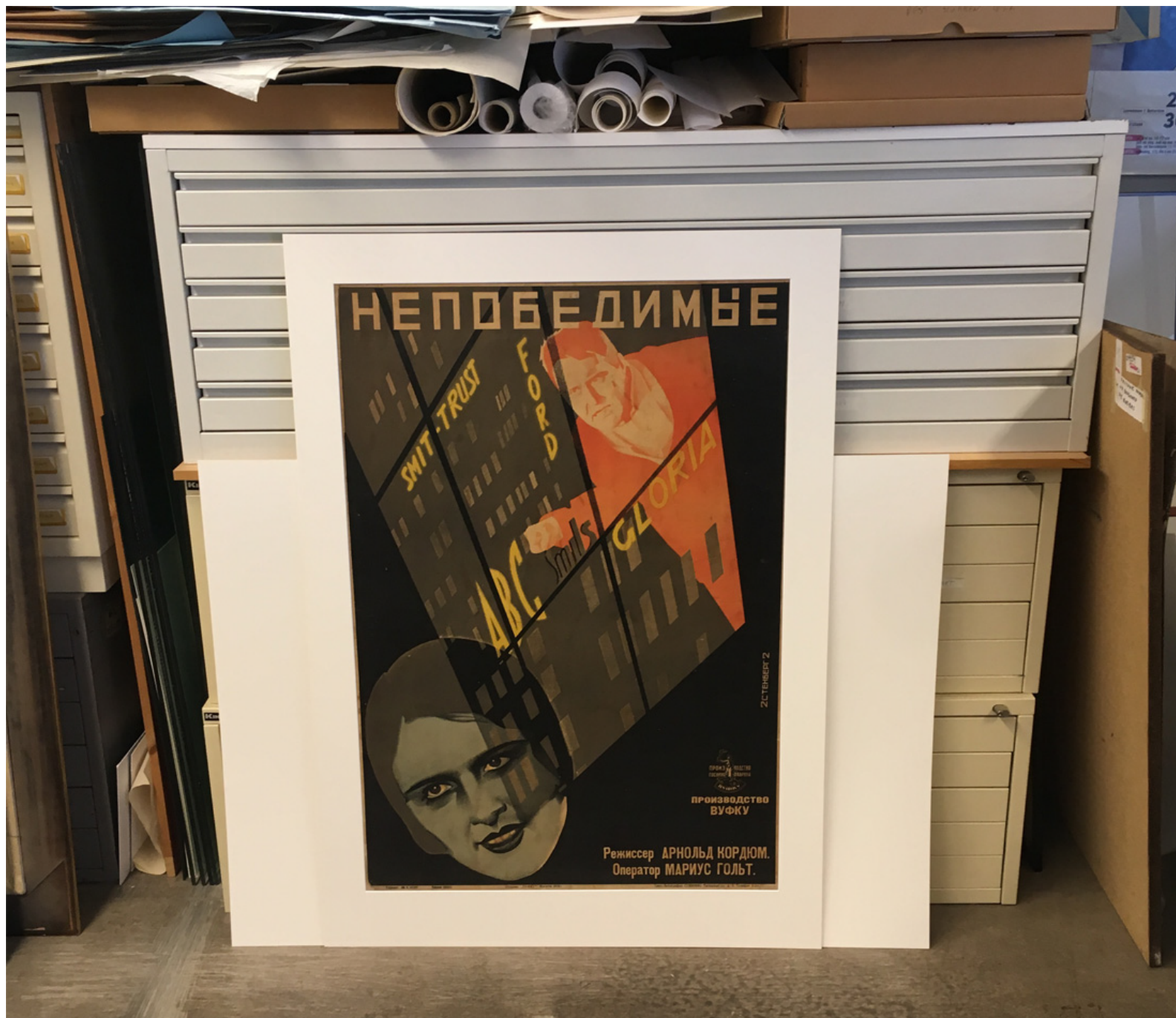
In 2019 Galerie VIVID ordered the careful restauration of this Stenberg poster, backed on Japanese paper, condition B