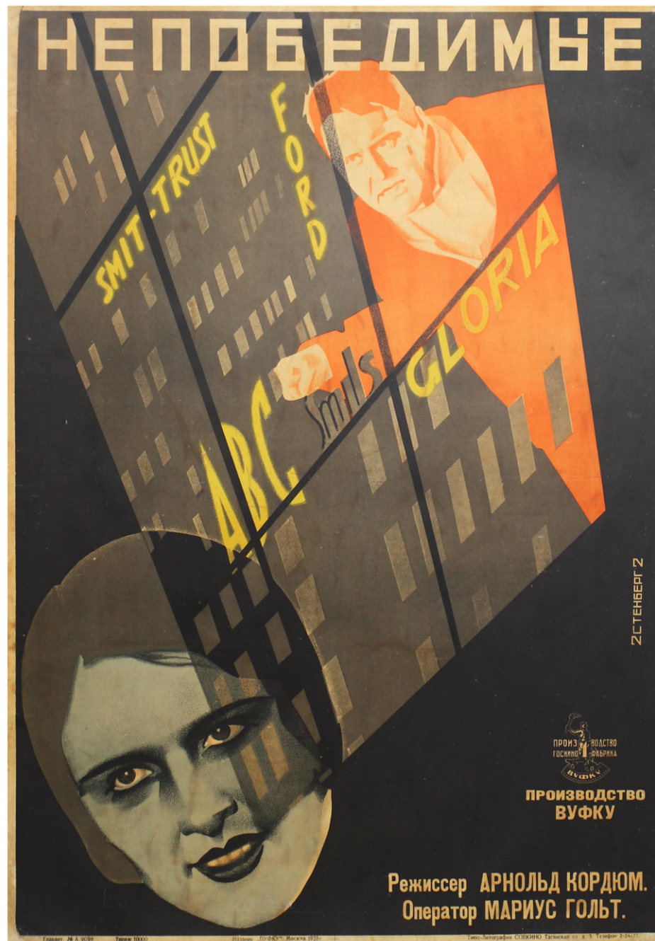
Nepovedimye (The Unvanquished) 1928. Offset lithograph, 100 x 72 cm, 39 3/8 x 28 3/8 inch, Film: Ukraine, 1928. Director: Arnold Kordium